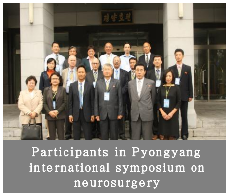
Participants in Pyongyang international symposium on neurosurgery