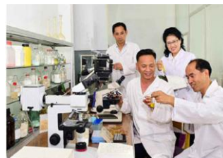
Joint surgery, research and development of technology conducted by the KMA on an international scale