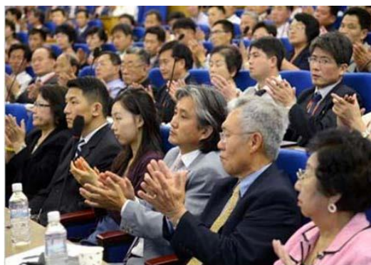
20 th Pyongyang Symposium of Medical Science of Korean Compatriots at Home and Abroad