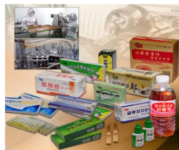
Efficacious Koryo medicines and medical appliances produced by chemists' and manufactories