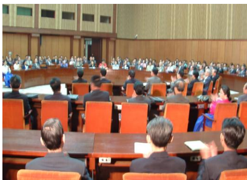
21 st Pyongyang Symposium of Medical Science of Korean Compatriots